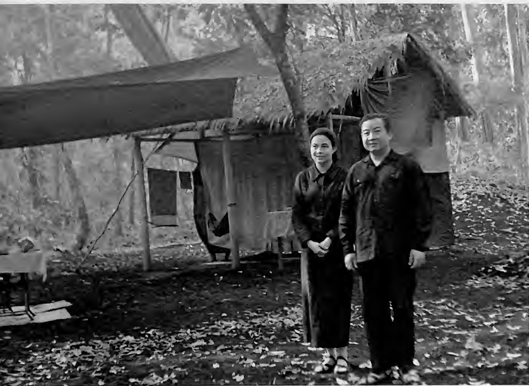
At a campsite in the forest.